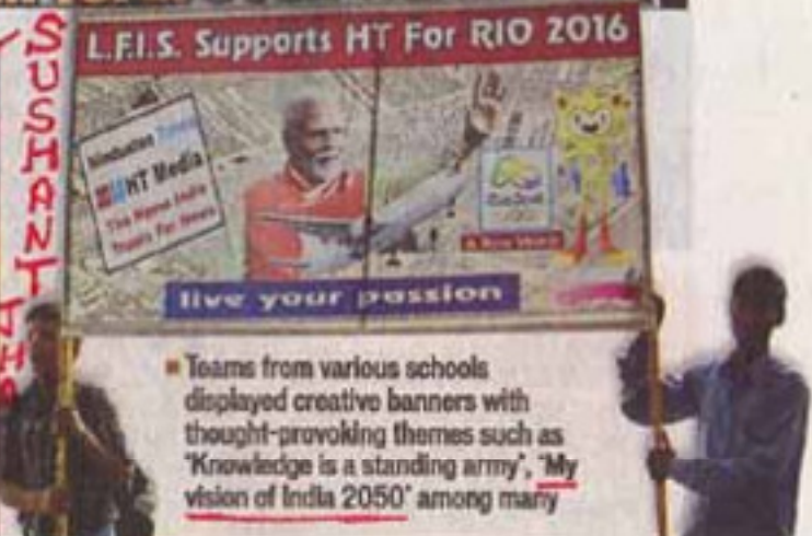
Teams from various schools displayed creative banners with thought-provoking themes such as 'Knowledge is a standing army', 'My vision of India 2050' among many