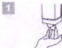
1 Apply enough soap to cover all hand surfaces;