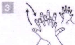
3 Right palm over left dorsum with interlaced fingers and vice versa;