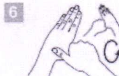
6 Rotational rubbing of left thumb clasped in right palm and vice versa;