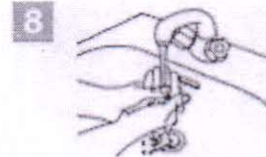
8 Rinse hands with water;