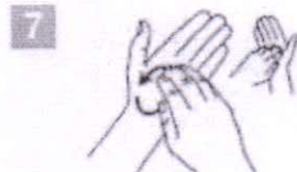
7 Rotational rubbing, backwards and forwards with clasped fingers of right hand in left palm and vice versa;