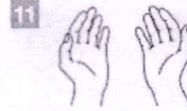
11 Your hands are now safe.