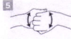
5 Backs of fingers to opposing palms with fingers interlocked;