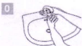
0 Wet hands with water;