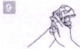
9 Dry hands thoroughly with a single use towel;