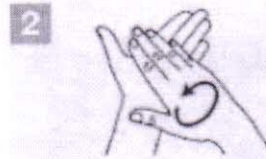
2 Rub hands palm to palm;